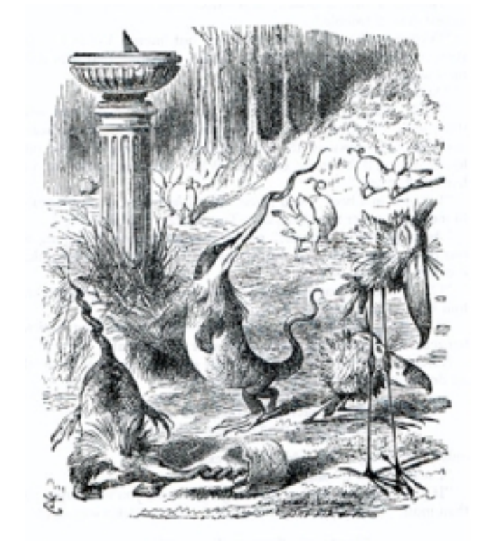
What is the point of asking questions if we are not free to answer? What is the point of answering if the questions are always false?

An Anarchist Publication Volume 5, Number 3, Spring, 2006